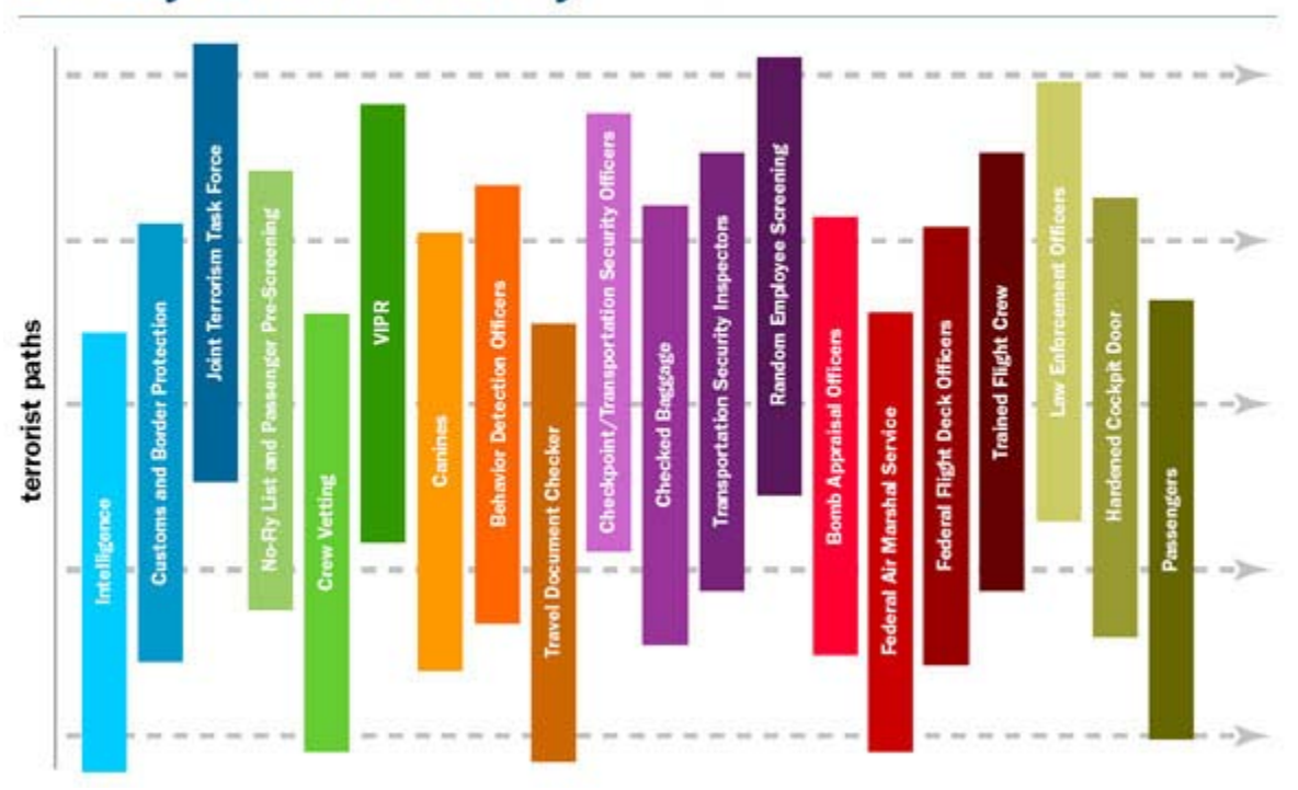
Figure 2. TSA Layers of Security